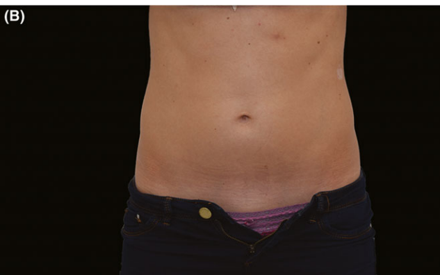
FIGURE 3 Digital images before (A) and 3 months after last procedure (B). Subject 13, age 30, BMI 18.9, waist circumference –3 cm (–4.0%), weight unchanged

would not be suitable candidates for fat debulking treatments, such as suction based or stamping fat reduction devices. The primary goal was to understand if HIFEM can be used for lower BMI patients who are not ideal candidates for other available technologies.