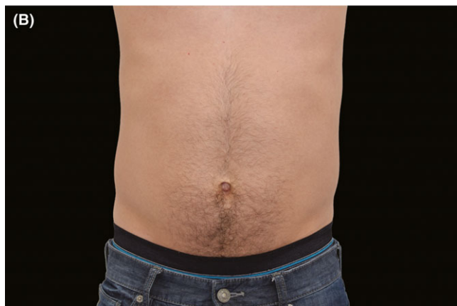
FIGURE 4 Digital images before (A) and 3 months after last procedure (B). Subject 11, age 33, BMI 25.2, waist circumference –7 cm (–7.7%), weight change –1.8 kg (–2.2%)

and is exposed to the extreme condition, which triggers a stress response in the tissue. Energy for supplying the contractions is taken from the fat cells presumably through lipolysis. The same effect, when muscles begin to use lipolysis as an energy supply, has already been seen during intense acute resistance exercise. <sup>15,16</sup> Further, when regularly exposed to these conditions, the muscle needs to adapt to them, which leads to a volumetric growth of muscle (hypertrophy) <sup>17,18</sup> and possibly hyperplasia. <sup>19</sup> The waist circumference reduction can therefore result from both fat reduction and strengthening and tightening of the abdominal wall. The lack of weight loss after the treatment thus appears to be logical effect since the weight of lost fat tissue is compensated by the weight of gained muscle volume.