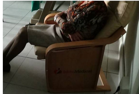
Fig. 1 Patient (women, 66 aa) with Urge Urinary Incontinence in treatment (first session) with Functional Magnetic Stimulator-Magneto STYM. [Colour figure can be viewed at wileyonlinelibrary.com].

38–82 years) who visited the “Second Opinion Medical Network” (Modena, Italy) as new patients for their UI: 10 patients (50%) with stress UI, 4 (20%) with urgency UI, 6 (30%) with mixed UI (Table 2).