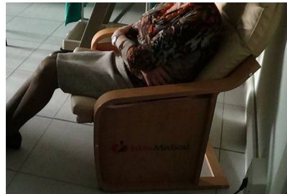
Fig. 1 Patient (women, 66 aa) with Urge Urinary Incontinence in treatment (first session) with Functional Magnetic Stimulator-Magneto STYM. [Colour figure can be viewed at wileyonlinelibrary.com ].

38–82 years) who visited the “Second Opinion Medical Network” (Modena, Italy) as new patients for their UI: 10 patients (50%) with stress UI, 4 (20%) with urgency UI, 6 (30%) with mixed UI (Table 2).