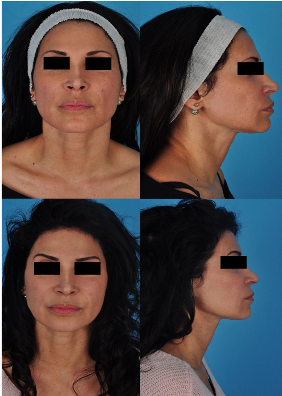
Fig. 2. Forty-nine-year-old female who underwent ThermiTight for submental skin laxity and jowling. Preoperative (A) and 12 months post-procedure (B) front and profile views.

course for the facelift was complicated by facial cellulitis. She did not have any underlying immunologic deficiency, diabetes, autoimmune disease, or wound healing history. She was seen at her first postoperative visit 6 days after ThermiTight treatment, admitted to the hospital and started on intravenous antibiotics. A CT scan demonstrated cellulitis of the left face without a drainable collection. She did not improve on intravenous antibiotics and a bedside incision and drainage was performed. Fifteen cc of pus was drained from the ThermiTight treatment site and cultures grew methicillin-resistant Staphylococcus aureus (MRSA). She was discharged home the following day with an oral antibiotic regimen. She did not have any other sequelae from treatment and subjectively was satisfied