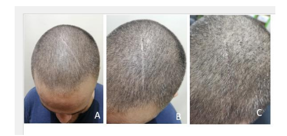
Fig 4: Male patient, 36 years old, with cicatricial alopecia of the scalp showing excellent improvement after 6 months of nanofat injection and hair transplantation. A and B. Before, C. After treatment